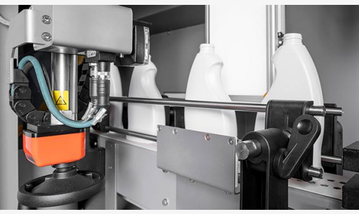
Bottle Orientation for asymmetric bottles for specific alignments