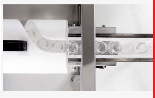
Bottle Cleaning for demanding products for delicate environments